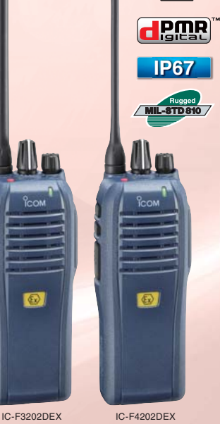
* Approval pending

DO NOT use the transceiver with any other equipment not specified in the option list (Pages 10-12).